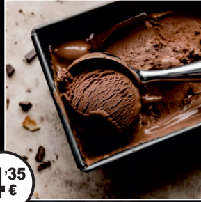
Chocolate Ice Cream Helado de chocolate