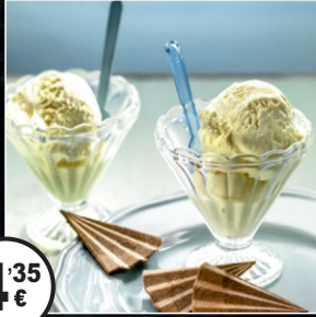
Vanilla Ice Cream Helado de vainilla