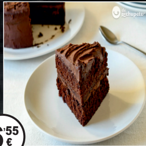
Chocolate Fudge Cake Pastel de chocolate