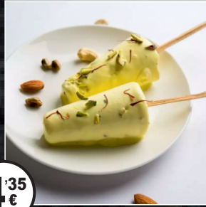
Pista Kulfi Kulfi de Pistacho