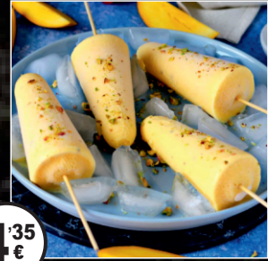
Mango Kulfi Kulfi de Mango