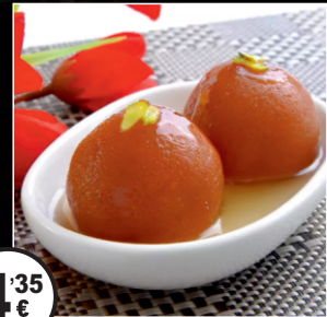
Gulab Jamun Gulab Jamun