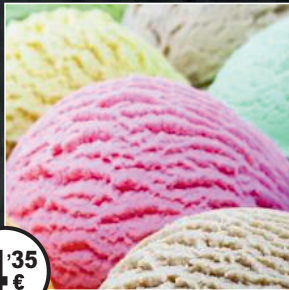
Mixed Ice Cream Helado Mixto