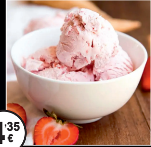
Strawberry Ice Cream Helado de fresa