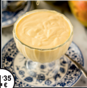
Mango Cream Crema de Mango